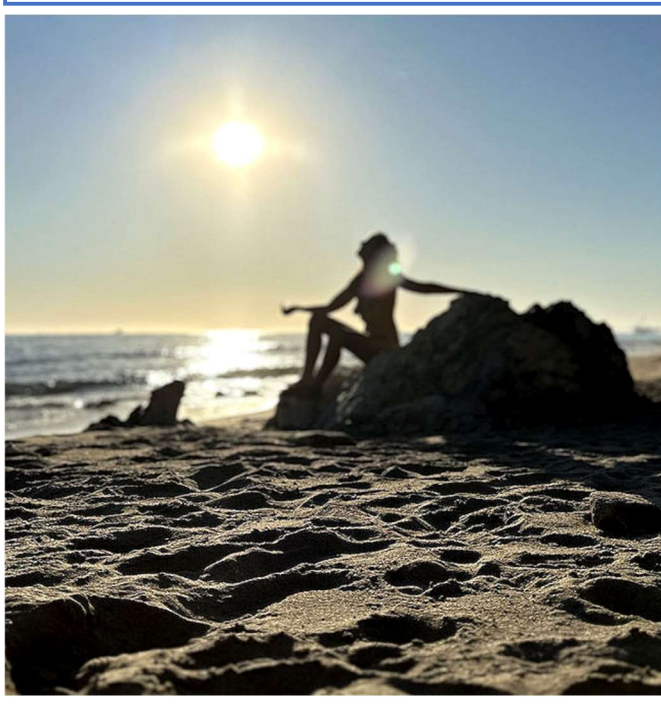
Phot Album of 2023. See Page 4

Friday, Mar xx, 6:45 PM Member's Dinner Meeting, Ventura Tuesday, Mar xx, 7:00 PM Online Meetup