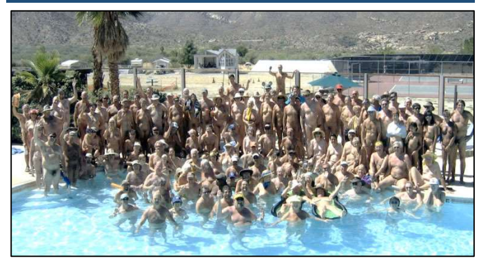
Happier Times at De Anza: 2005 Naturist Society Western Gathering

The sale and potential sale of the nudist property, changes in club policy, and replacement of longtime managers have rocked the nudist community in California this year. The ripple effects are still widely felt as these stories continue to play out into the new year. In chronological order: