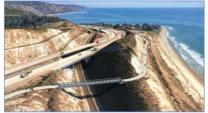
Back under consideration is a proposed hiking & bike trail on the south (ocean) side of the cliffs above Bates Beach.

Carpinteria City Council Reverses Rincon Trail Decision On May 15, by a 3-1 vote, the Carpinteria City Council reversed its decision from a year ago and supported the controversial ocean-side path for the proposed Rincon Trail.