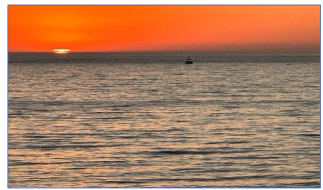
Sunset at Bates. Photos submitted by Helen

Our members and friends responded to the postponement by coming in large numbers the following Sunday. The weather was perfect, with temps in the high 70's, bright sun, and a sea temp around 68 degrees. A few people reported getting tar on their feet, attributed to the ocean churning it up off the bottom during the recent storm. The tar was easily removed with a few drops of baby oil.