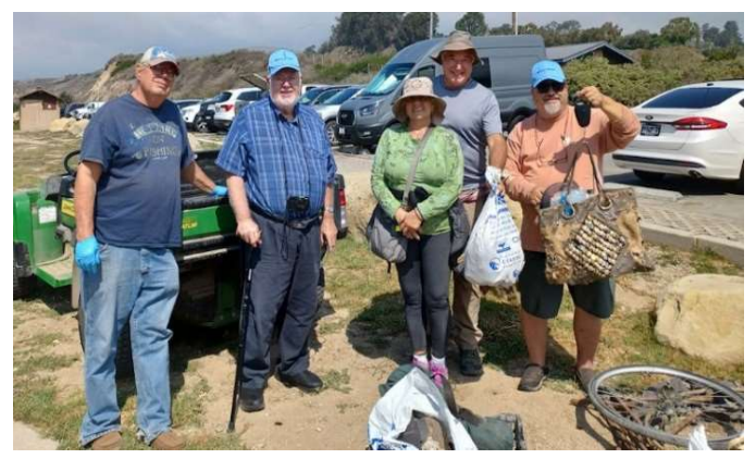
Some of our cleanup volunteers pose with their collected trash.