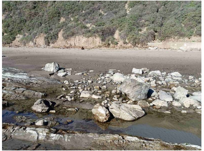
Above: Uncovered rocks at the start of our designated area.

The large storm that hit the area between Christmas and New Year's brought mud and debris cascading down from the nearby hills and streets and made a mess of Carpinteria's streets and beaches. A second storm hit a week later and dropped over four inches of rain in 10 hours. The 101 Fwy between Ventura and Santa Barbara was closed for several days due to flooding and mudslides, and water at high tide carried into the city as far as the railroad tracks at First Street. The coastal hamlet of La Conchita , one mile from Bates, was evacuated for several days as a precaution. Many of the county's beaches lost so much sand that they practically disappeared at high tide. Bates Beach lost approximately 10 feet in height, uncovering long-forgotten rocks and concrete bric-brak.