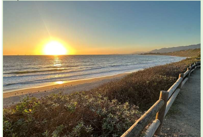
Helen took this photo of the sunset from above Bates Beach.