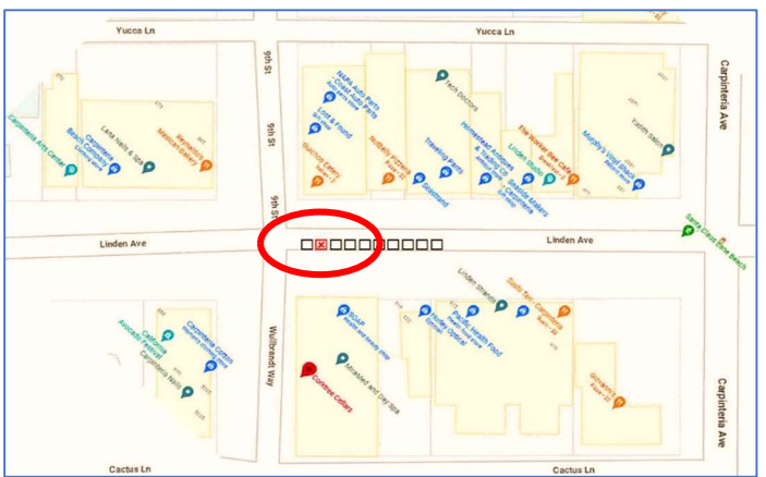
Our booth is in a great location this year! It is between Carpinteria Avenue and 9<sup>th</sup> Street facing east (see the box marked "X" above).