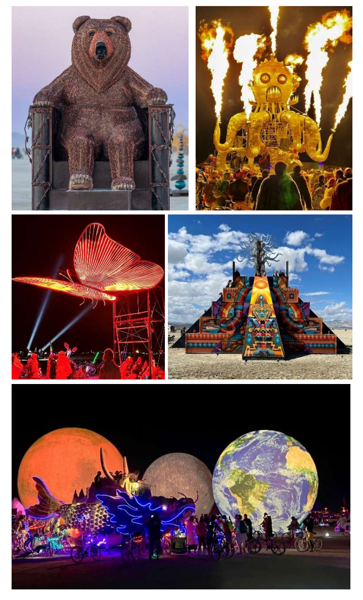
More Burning Man photos are on the next page

I look forward to going back again next year, getting nekkid, and asking Global Warming "Is <u> THAT </u> all you got?"