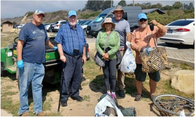
Some of our cleanup volunteers pose with their collected trash.

Across California, it was reported over 25,570 volunteers had picked up 126,605 pounds of trash from its beaches, lakes, and river beds, and an additional 7,041 pounds of recyclable materials, for a total of 133,645 pounds or 67 tons.