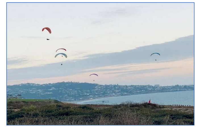
Paragliders graced the skies over Black's Beach while we were there.

Note: (Ron Mercer of NitOC at 32:17 placed 11th overall)