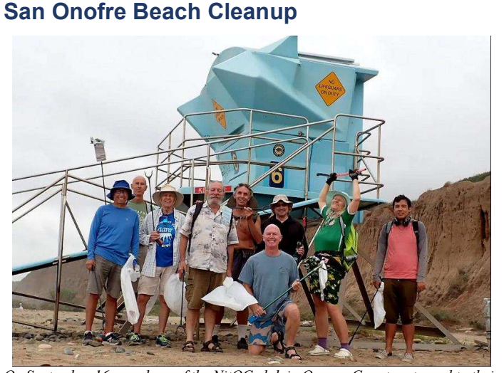
On September 16, members of the NitOC club in Orange County returned to their old haunts and did their Beach Cleanup of the Trail 6 section of San Onofre Beach.