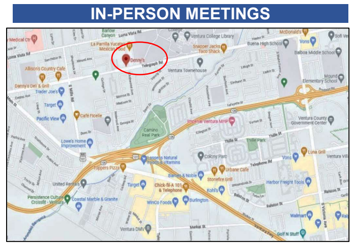
Map to Denny's Restaurant on Telegraph Road in Ventura