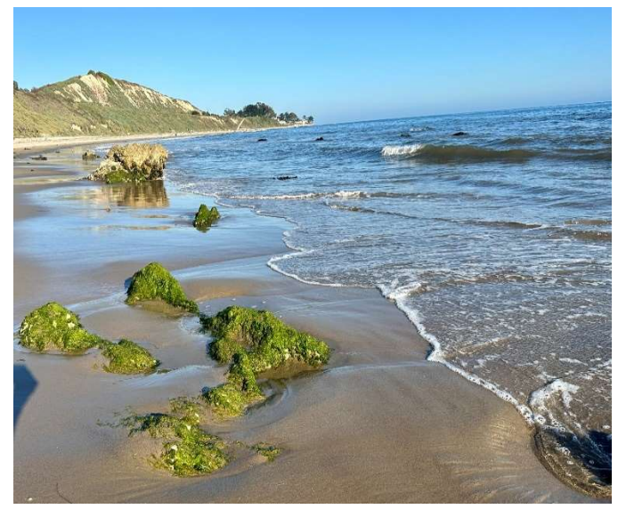
A water temp of 68 allows green moss and algae to grow on the rocks.

Visit www.meetup.com/Friends-of-Bates-Beach / to see if others in the group may be there on the day you want to go and to read any up-to-the-minute news from other members or if we have to cancel a Tuesday/Thursday in case of sudden overcast, etc. On that website, we coordinate meeting times and carpooling (given enough lead time). The site also contains non-beach activities for our group. It's free to sign up! Please sign up if you haven't already (you can also do so anonymously).