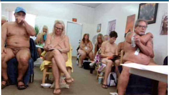
Screen capture of AANR-West Regional Assembly meeting July 29 at De Anza Springs Nudist Resort.