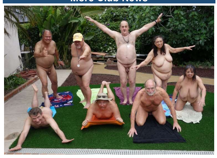
Bates Beach members "Towel Surf" at June 10 party in Camarillo.