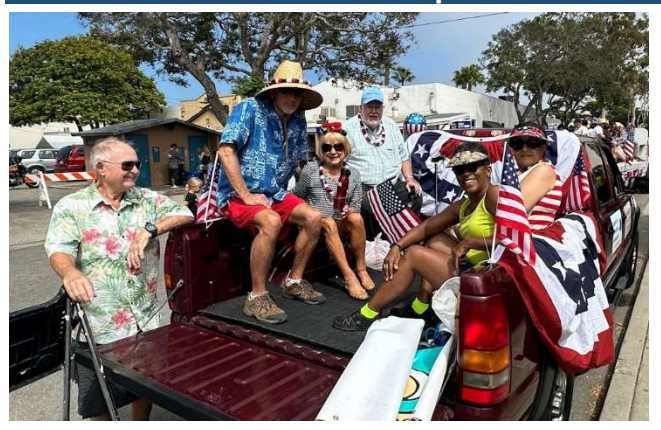
Volunteers crunching into the back of the truck.