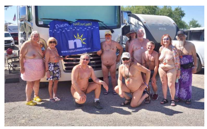
A dozen members of the Southern California Naturist Association and Friends of Bate Beach participated in the Festival