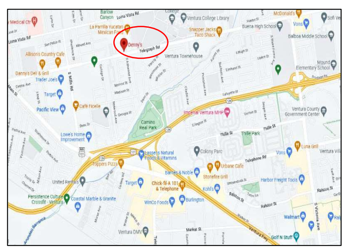
Map to Denny's Restaurant on Telegraph Road in Ventura

These dinners are on the second Friday of each month at the Denny's Restaurant on Telephone Road in Ventura (near Ventura College) starting at 6:45 PM. You will be responsible for buying your meals. The meetings usually last until about 8:30 PM.