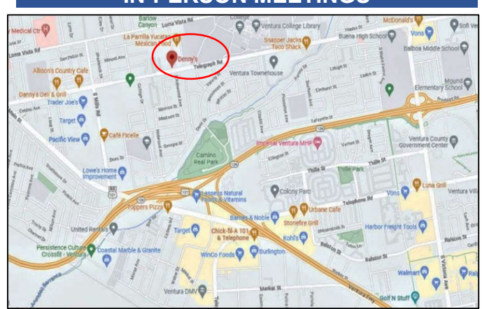
Map to Denny's Restaurant on Telegraph Road in Ventura