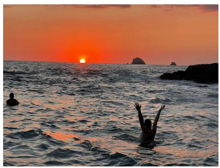
One of the magnificent sunsets we observed at Zipolite, Mexico.