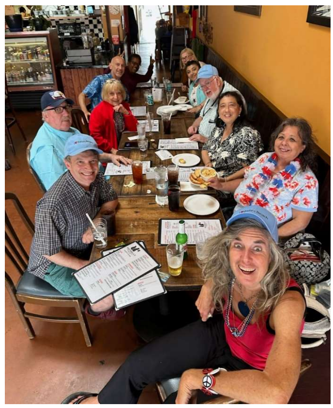
All the parade volunteers enjoyed dinner afterward at Nutbelly's.