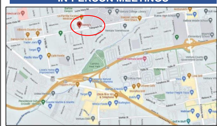
Map to Denny's Restaurant on Telegraph Road in Ventura