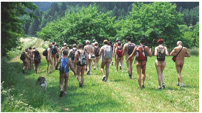
Sun. Oct. 08, Morongo Valley - Big Morongo Canyon

A moderately challenging day hike owing to the rollercoaster nature of the trail. We will only go as far as Horsethief Creek, which features year-round water except during the most extreme drought as well as beautiful riparian shade trees such as Fremont cottonwoods and willows. After lunch and exploring the canyon downstream of the trail, we will head mostly uphill to an old limestone quarry on the way back to the parking lot. 5.1 miles, 1230 feet of gain, approx. 5 hours. Moderate, some chance of textiles. Meet 10:00 am at the Sawmill Trail Parking Lot, Pinon Flats Transfer Station Rd, Pinyon Pines, CA. (33.580046, -116.450424).