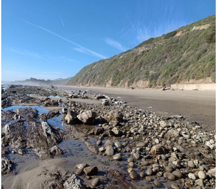
Bates Beach on February 11 shows exposed rocks at low tide at the designated clothing-optional area. See story on page 2.

April 14, Meetup Dinner, Denny's, Ventura 6:45 pm April 15, Potluck/Jacuzzi Party, Ventura, 2 – 8 PM April 21, Online Meetup, 9 7:00 pm