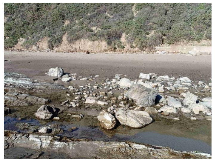
Above: Uncovered rocks at the start of our designated area. Below:: some lumber and debris still litters the beach.