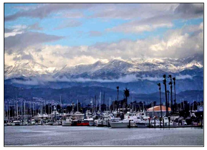
Following the unusually heavy rain/snowstorm of February 25-26, the Santa Ynez Mountain Range glistened with the results of record snowfall that was visible from Camarillo to Goleta.

Rincon Point is consistently listed among the Top 25 surf spots in the world.