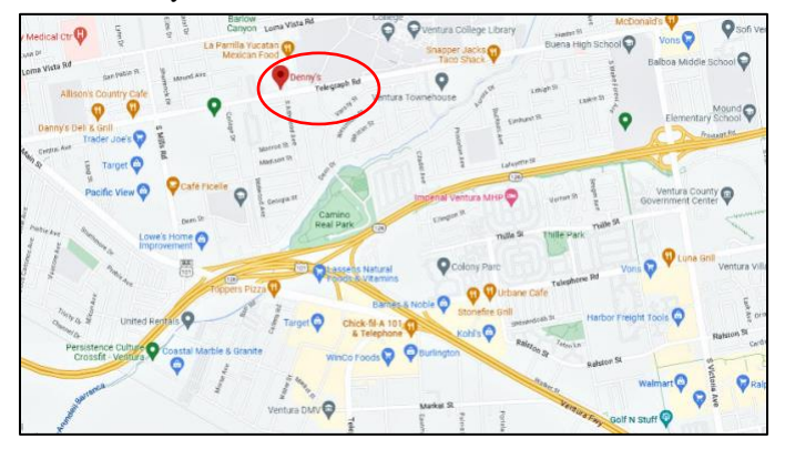
Map to Denny's Restaurant on Telegraph Road in Ventura

We look forward to seeing all of our Friends again! The dinner is open to anyone interested in learning about our scheduled beach activities and participating in our organizational business with ideas. As you can imagine, after this time layoff, there is much to discuss! See you there!