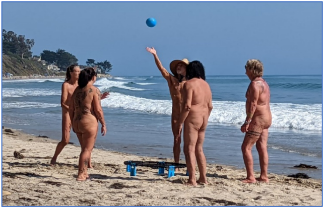
Fun at the August 20 Bates Beach Picnic. See story page 2.

Nov 11, Meetup Dinner at Denny's, Ventura 6:45 pm Nov 15, Online Meetup, 9 7:00 pm