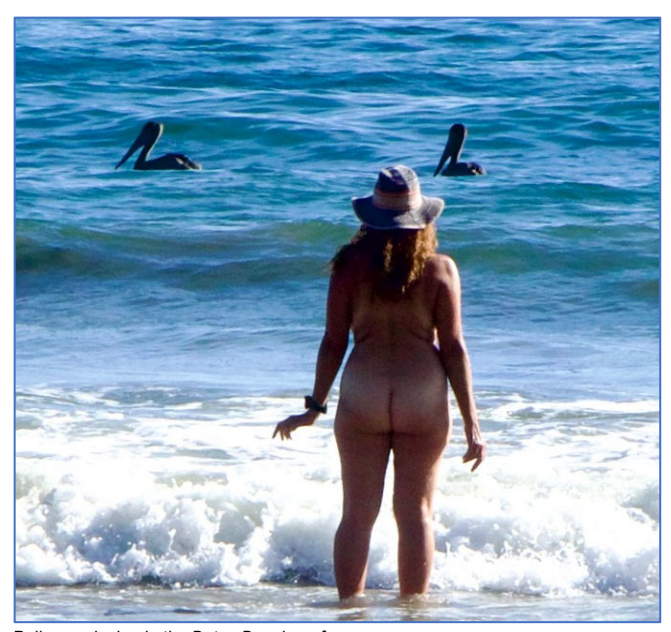
Pelicans playing in the Bates Beach surf,