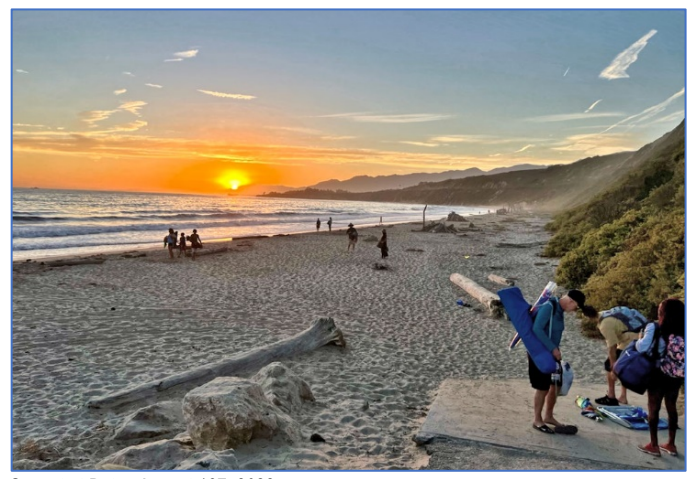
Sunset at Bates August 167, 2022

Thanks to all the members who are sending us photos from their experiences at Bates Beach. We will continue to share these with our readers as space allows. – Editor