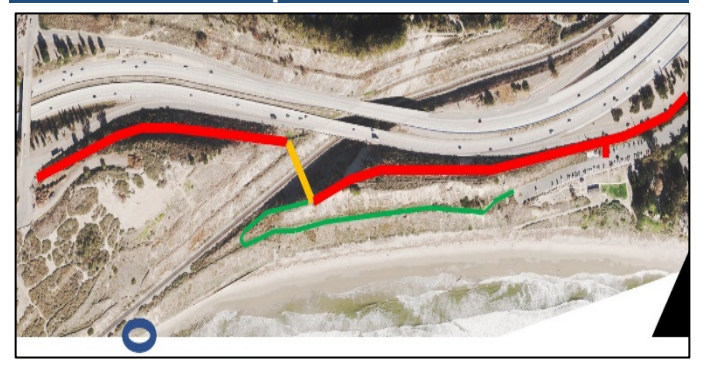
New proposed trail path (red) includes bridge (yellow) across RR tracks. Secondary walking path (green) is also proposed. Nude beach is circled (blue).