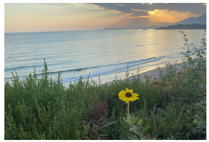
Flower at sunset.