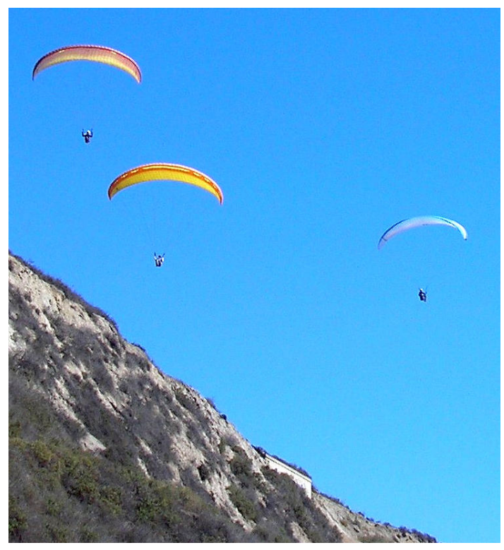
Paragliders sail above the Bates Beach cliffs where the proposed Rincon Trail path was rejected in April.