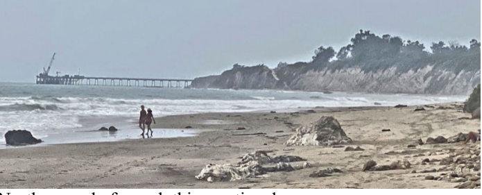
Northern end of our clothing-optional area.