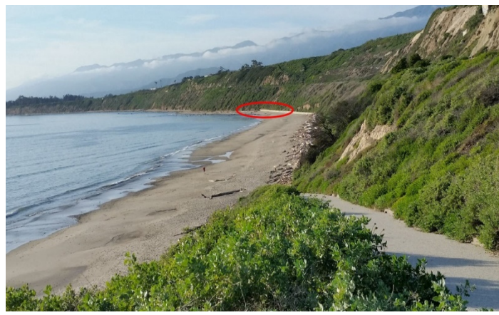
Where to find us: Designated clothing-optional area starts at the concrete rock slide

Join us from noon to about 6 pm at our designated clothingoptional location on the beach: Look for the sign for where our group is sitting.