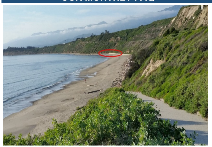
Designated clothing-optional area starts at the concrete rockslide