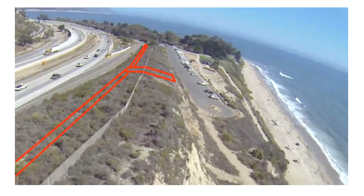
Red line shows the "pedestrian "notch" between the inland trail and the Bates parking lot which is only 20 feet away

At this writing, Ilasin is trying to arrange a convenient time to meet with Helen and the rest of the stakeholders (Carpinteria park officials, the paragliders, etc.) to go over the details.