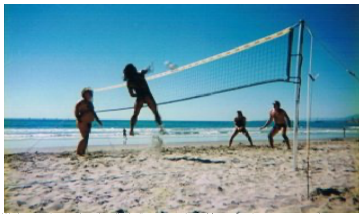
We hope to have a beach volleyball game on June 11, our first in over ten years

Aug 4, 11, 18, 25 Bates Thursday Picnics, Noon Aug 12 Meetup Dinner at Denny's, Ventura 6:45 pm Aug 16 Meetup Online 7 pm – 8:30 pm Aug 20 Bates Beach Multi-Club Picnic