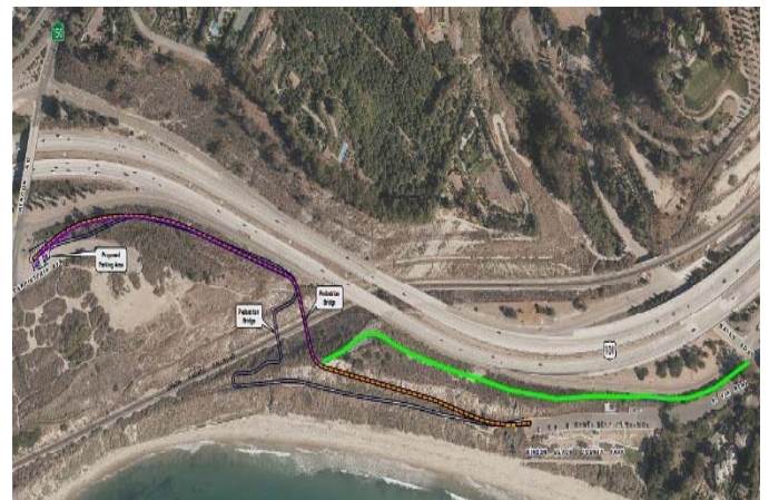
Council members saw no issues with the Trail's Alternative #4 (green line above) but they rejected Alternative #3 (the purple line) on the coastal side of the bluffs.

The final 4-1 vote by the Council to support the appeal filed was a pleasant surprise, but the arguments of the appellants proved compelling. Instead, the City Council asked the Trail designers to look seriously at "Alternative 4" as a preferred pathway. No timetable was given for when the designers will return a new plan, although it was mentioned during testimony that it may take 9-12 months to complete as a new Environmental Impact Report will have to be done.